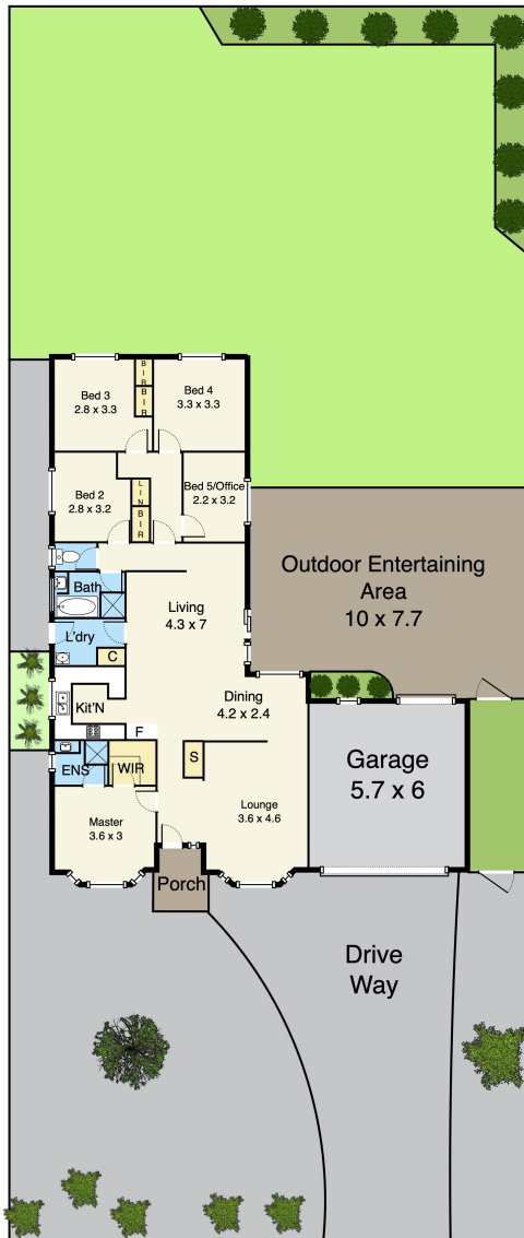
18 Darcy Street, Maddingley, VIC - 3340

*This floorplan is for illustration purposes only and no warranty is given to its accuracy. Purchasers are advised to carry out their own investigations.