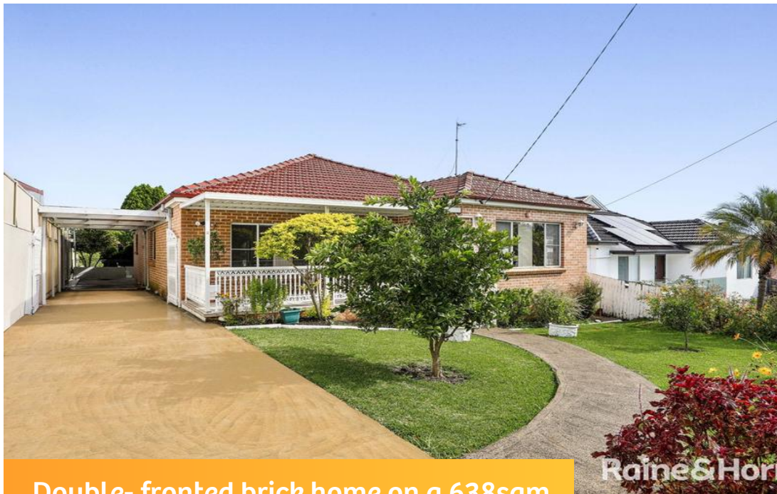
Double- fronted brick home on a 638sqm block