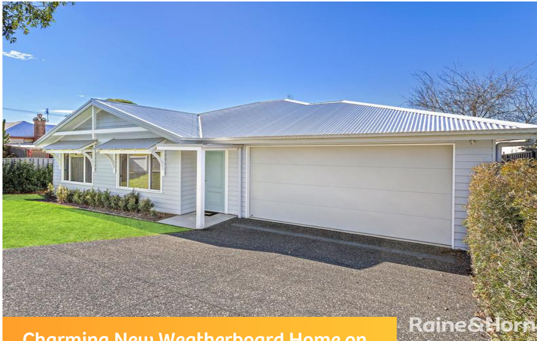
Charming New Weatherboard Home on Shoalhaven Street