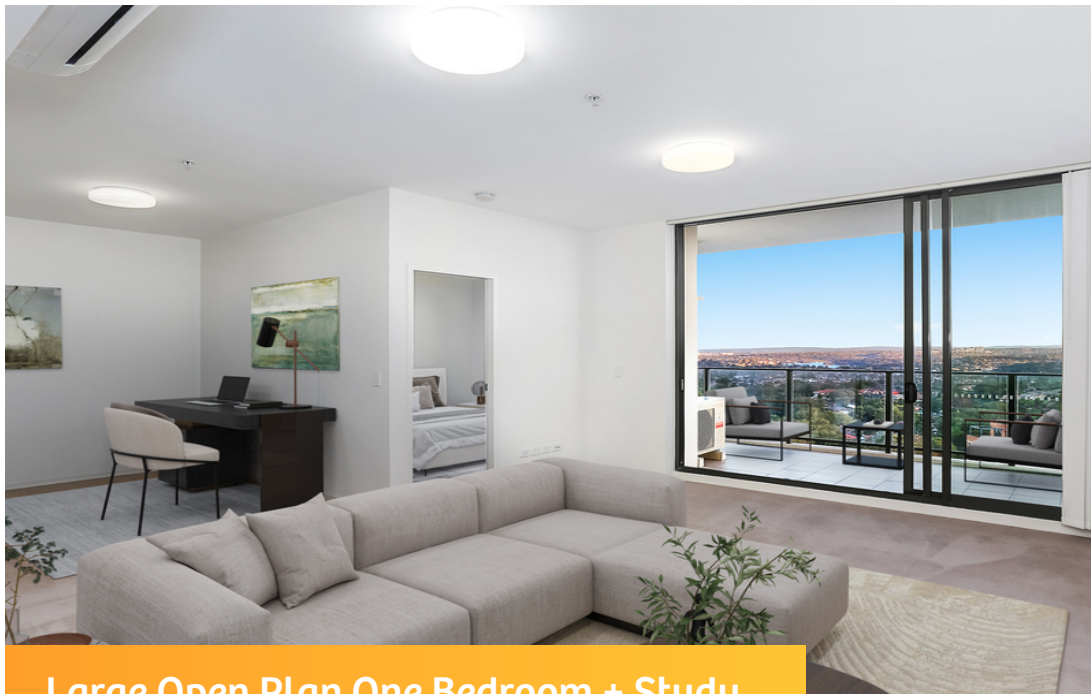
Large Open Plan One Bedroom + Study Apartment