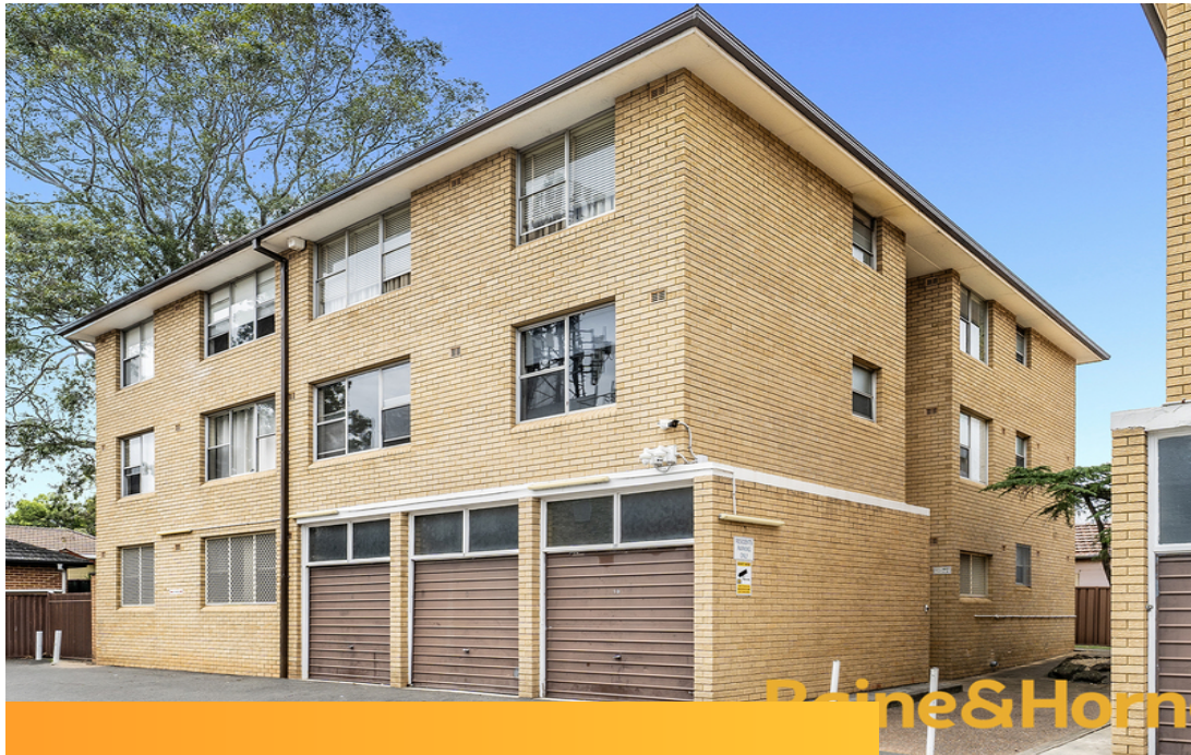
Classic - 1 Bedroom unit with parking