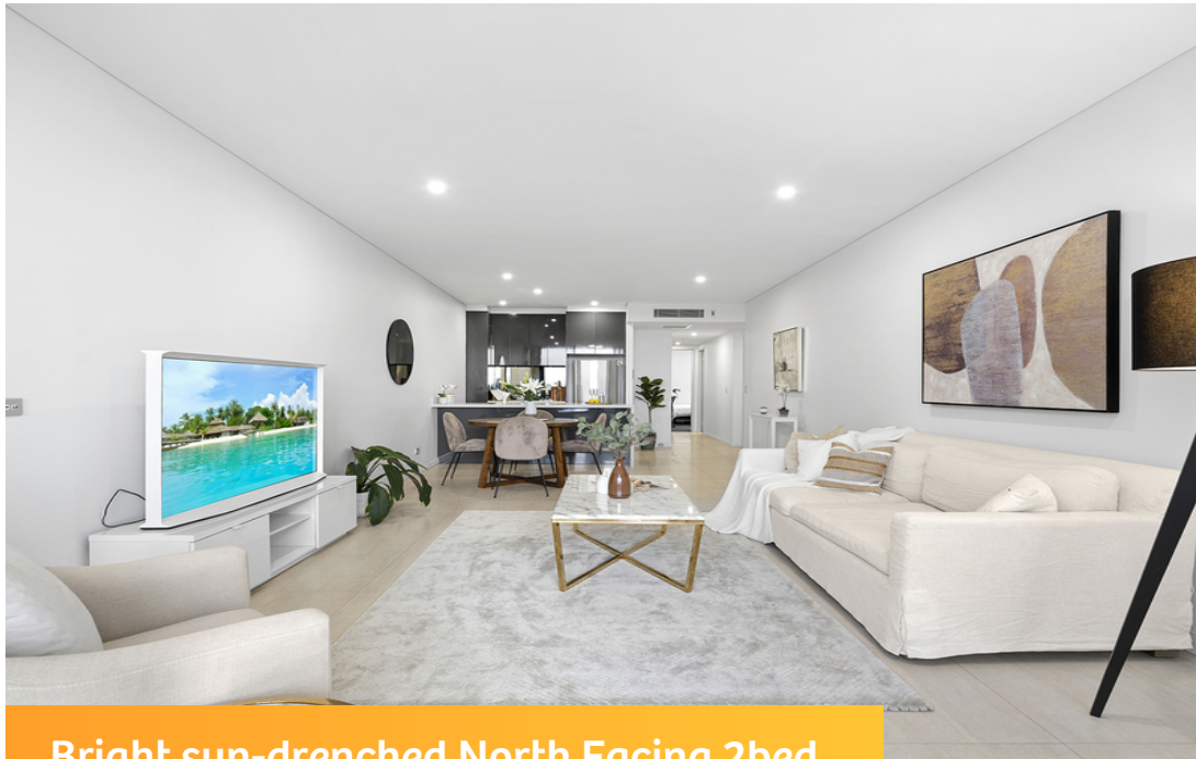
Bright sun-drenched North Facing 2bed apartment.