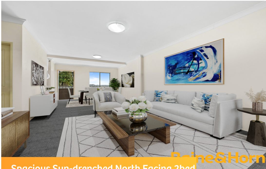
Spacious Sun-drenched North Facing 2bed apartment