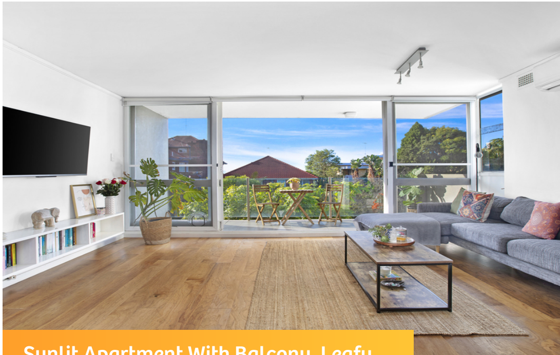
Sunlit Apartment With Balcony, Leafy Vista & Parking