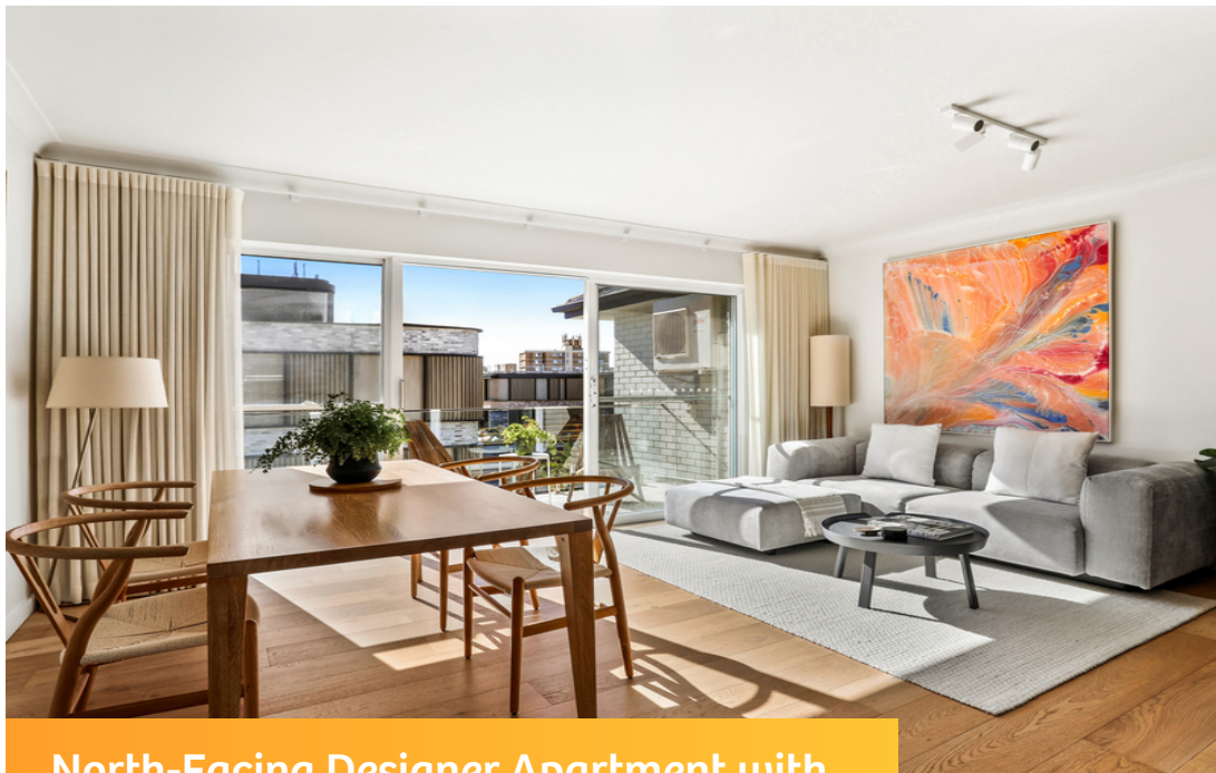
North-Facing Designer Apartment with Oversized Lock Up Garage