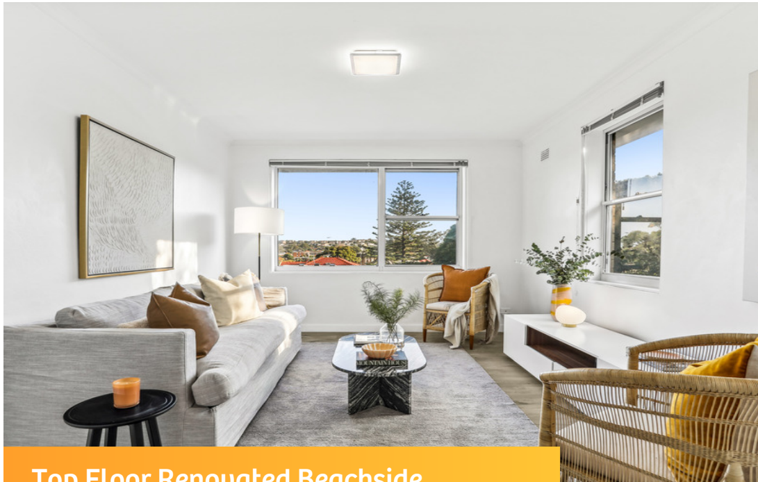
Top Floor Renovated Beachside Apartment, Secure Boutique Block Of Six