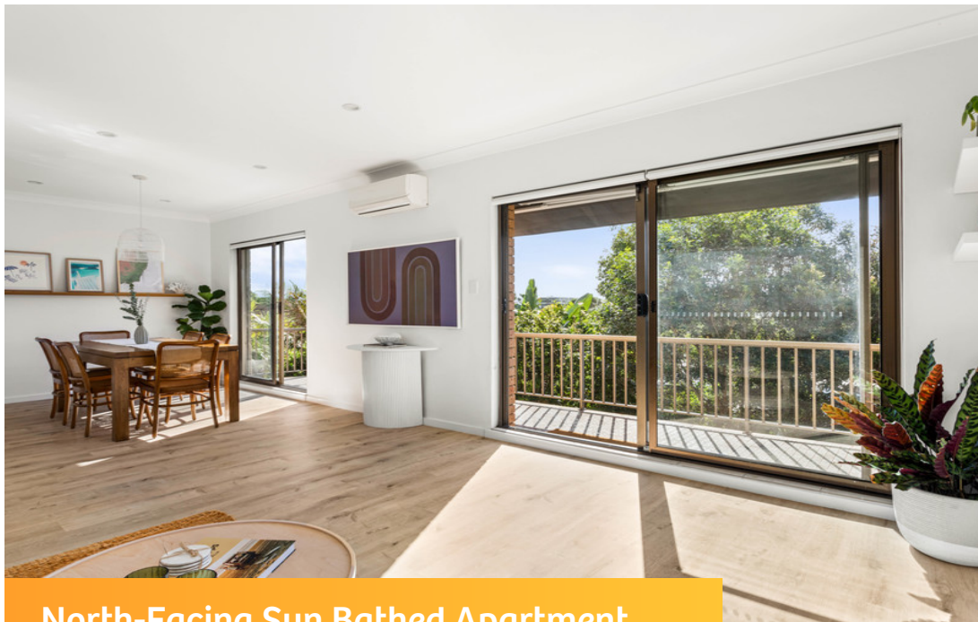
North-Facing Sun Bathed Apartment, Exclusive Access, Metres to Beach