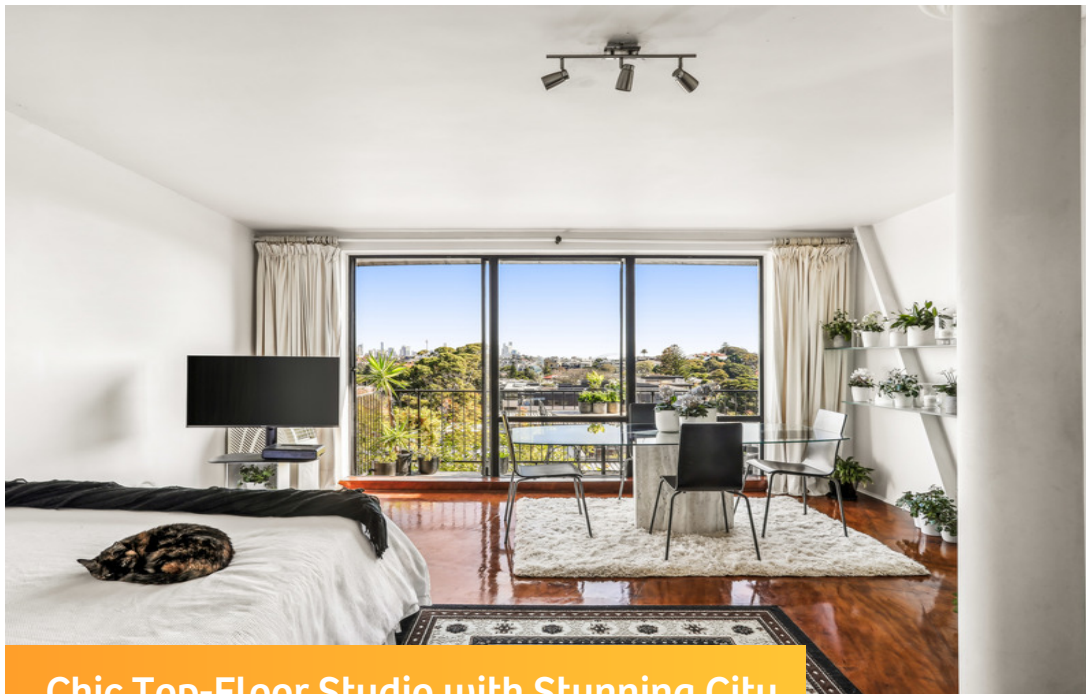
Chic Top-Floor Studio with Stunning City Views