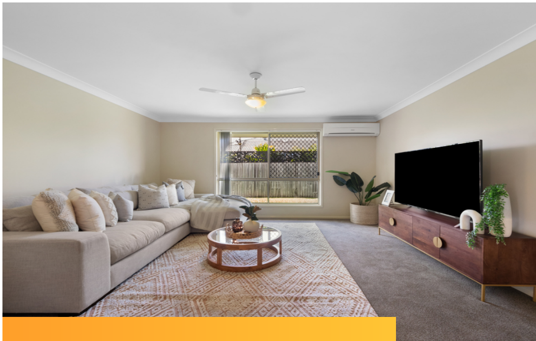
Spacious Home - Great Street