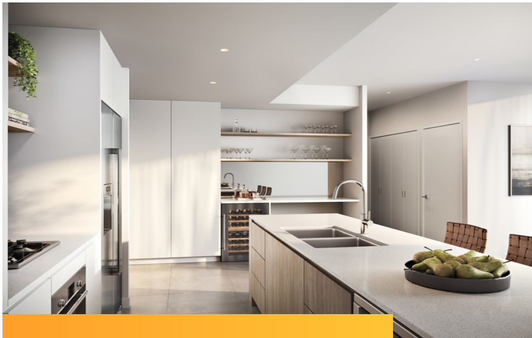
Luxury Waterfront Apartment $800,000