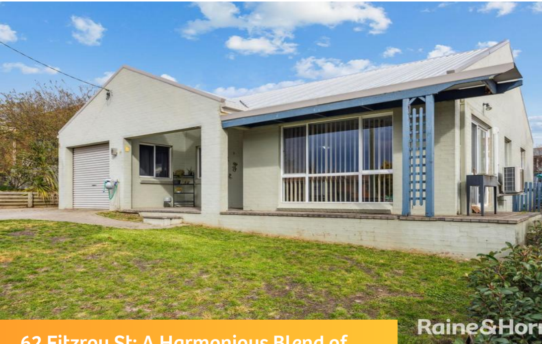
62 Fitzroy St: A Harmonious Blend of Style and Functionality