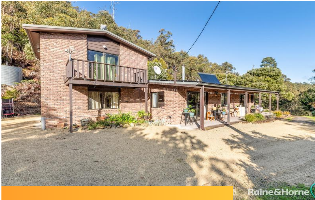
Delightful rural property