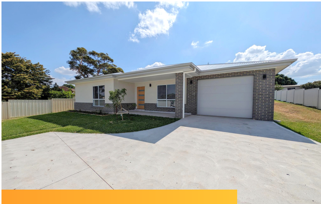
4 bedroom home in Denman.