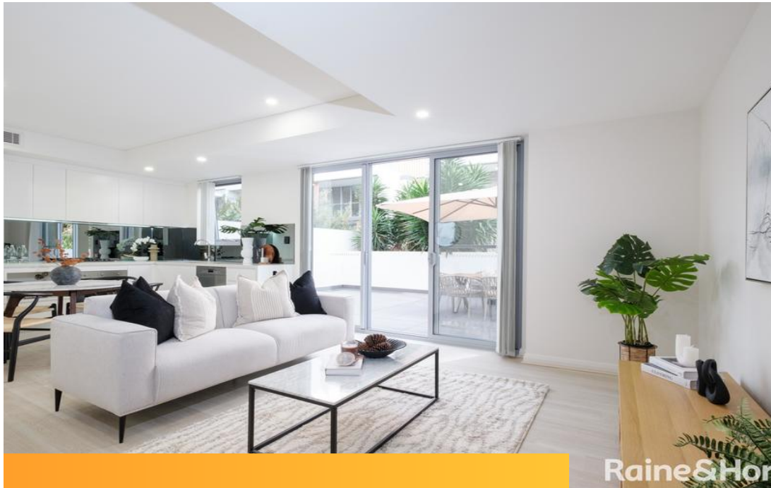
Spacious and Modern Living in Gordon