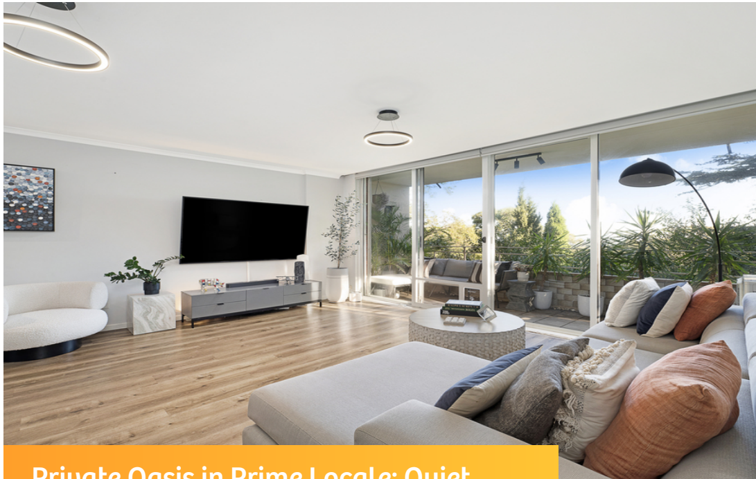
Private Oasis in Prime Locale: Quiet, Convenient, Spacious Apartment