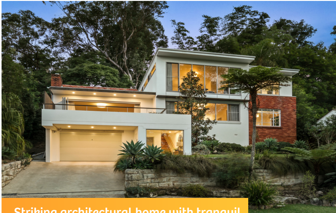
Striking architectural home with tranquil bushland outlook