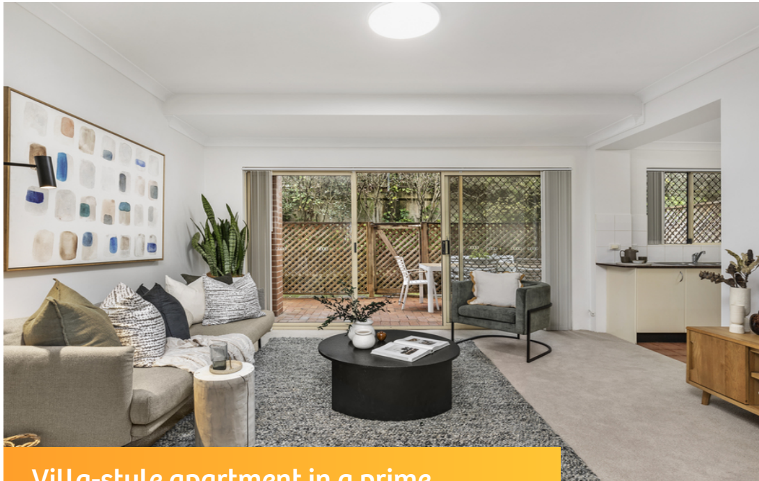
Villa-style apartment in a prime Chatswood location