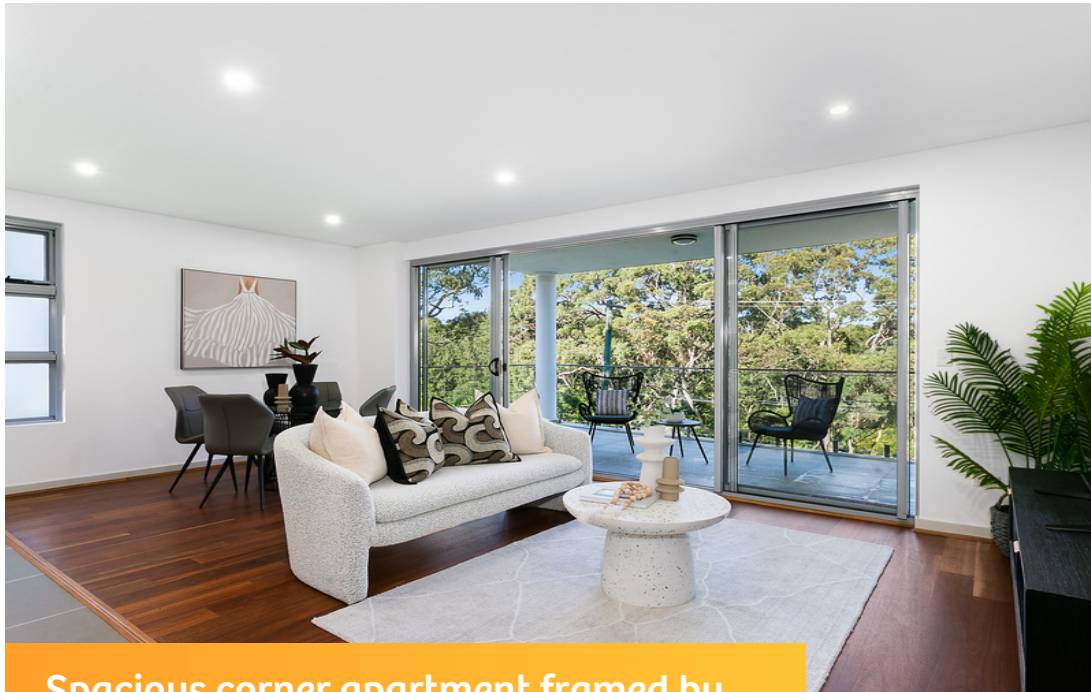
Spacious corner apartment framed by stunning reserve views