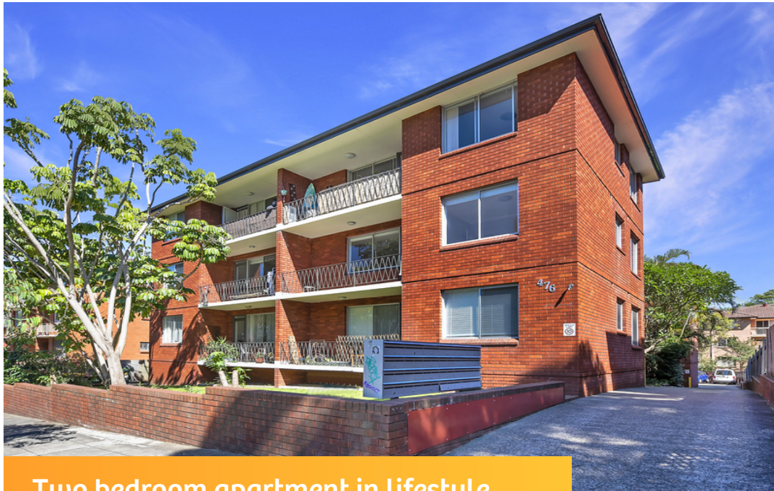
Two bedroom apartment in lifestyle location