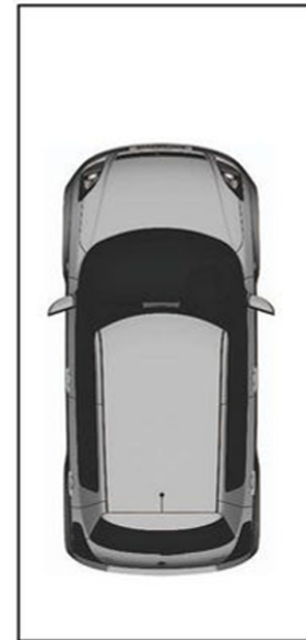
SINGLE CAR SPACE 2.5 x 5.5