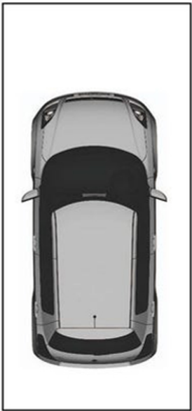
SINGLE CAR SPACE 2.5 x 5.5