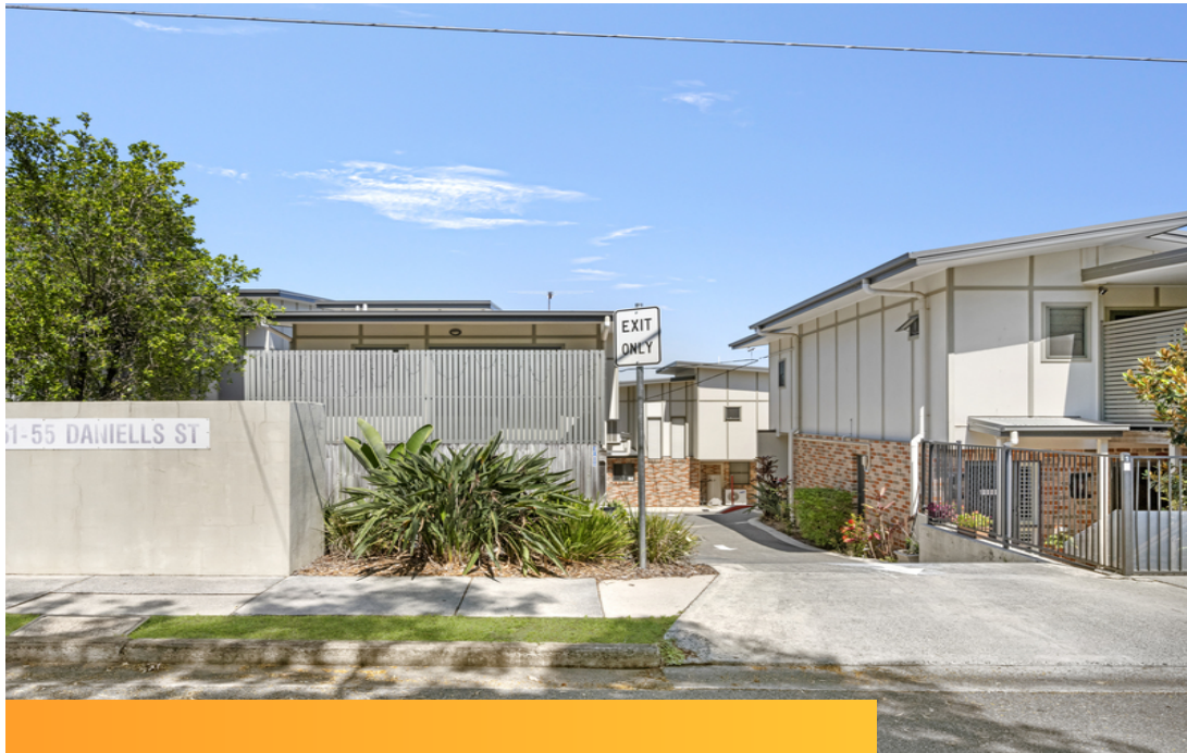
Private, 2 Bedroom unit in small complex