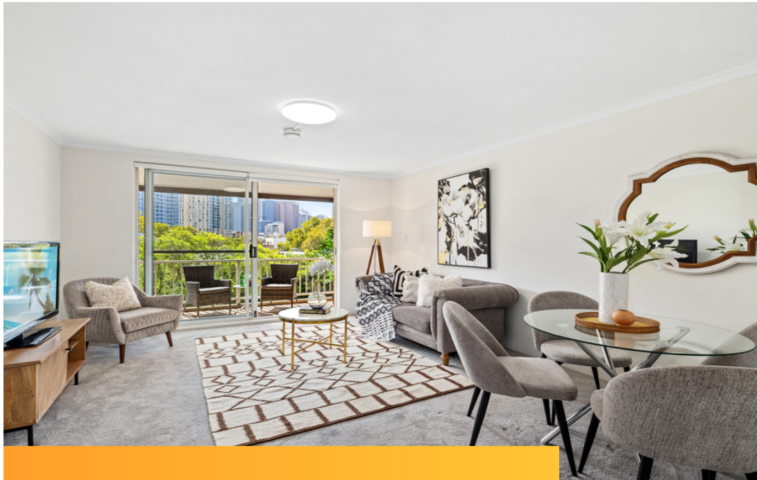
Idyllic City Pad