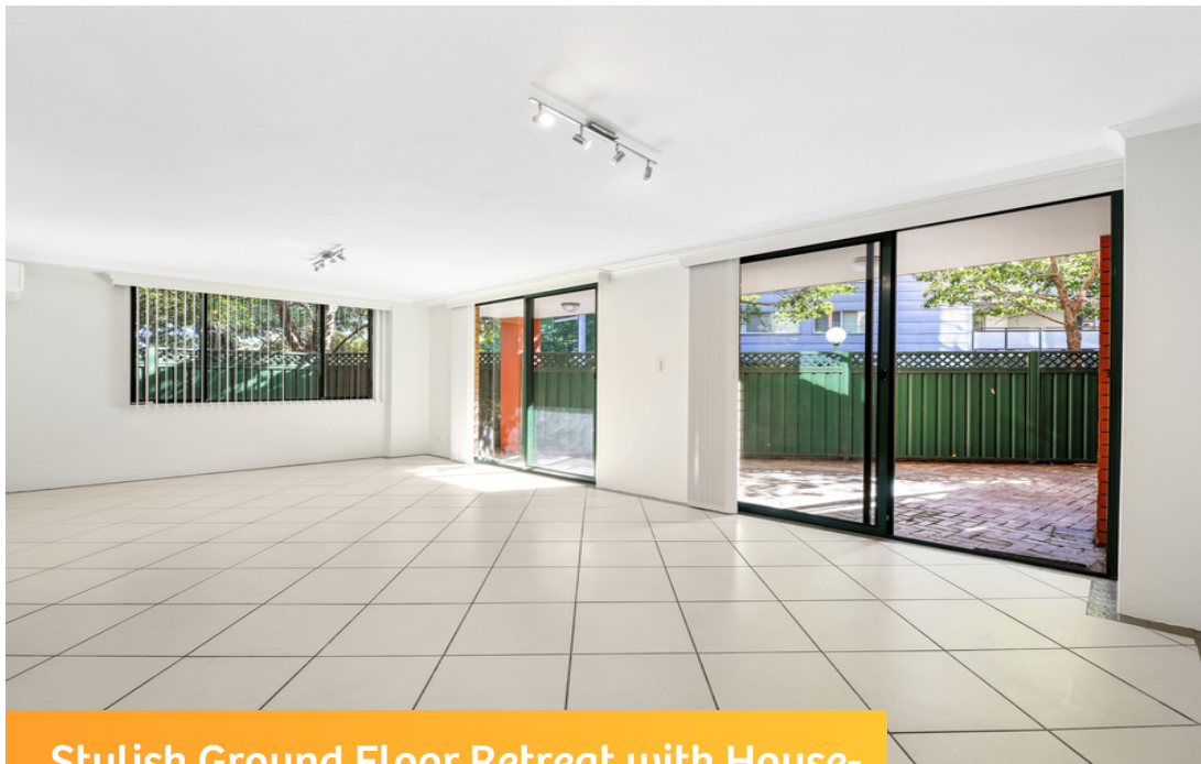
Stylish Ground Floor Retreat with House-Like Space