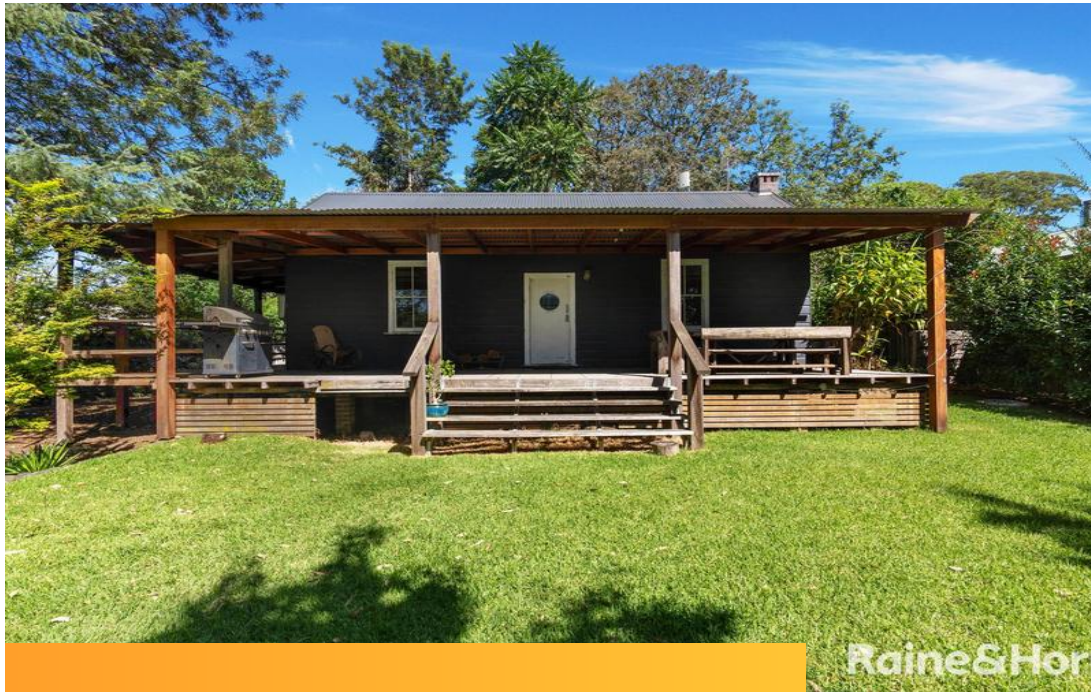
Charming Cottage - Near Kangaroo River