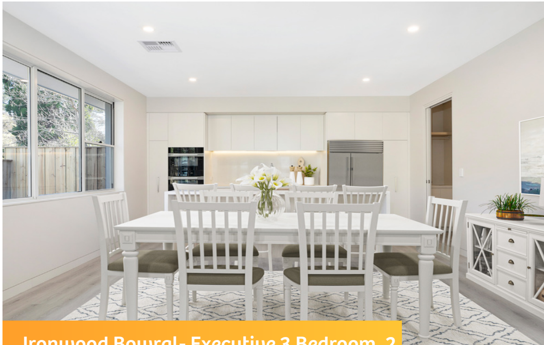
Ironwood Bowral- Executive 3 Bedroom, 2 Living Space Townhouse