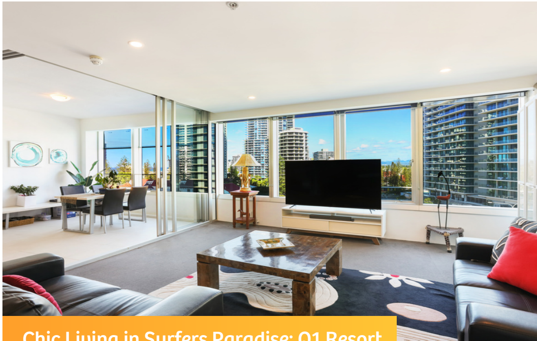
Chic Living in Surfers Paradise: Q1 Resort Apartment