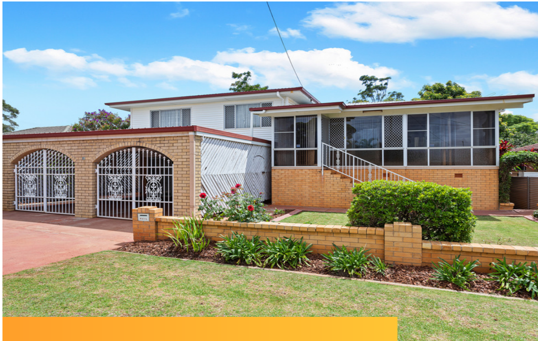
Neat Family Home in Rockville