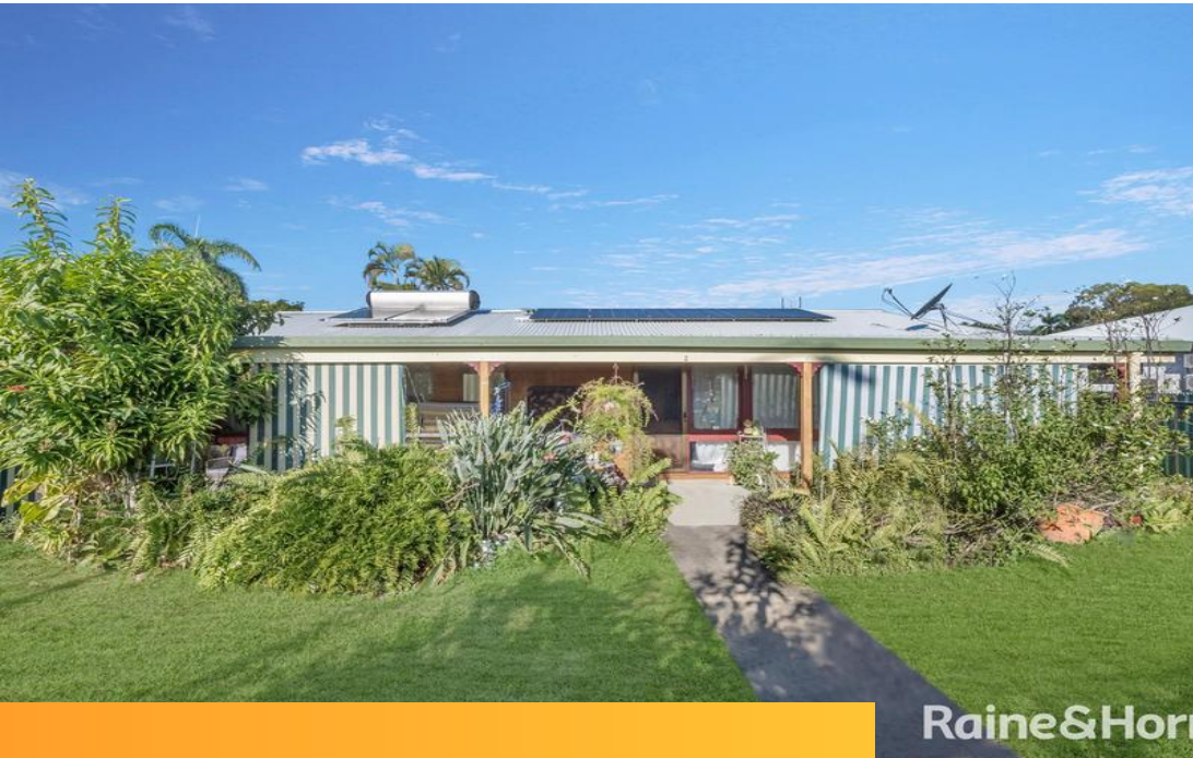
Charming red cedar home