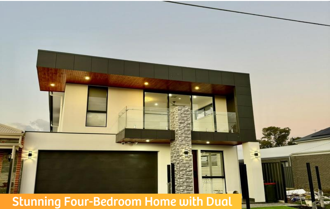
Stunning Four-Bedroom Home with Dual Ensuites: Luxury Living in a Prime Location