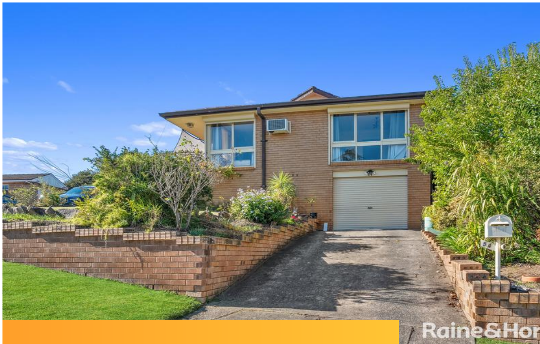
Dual Street Access: Solid Brick & Tile